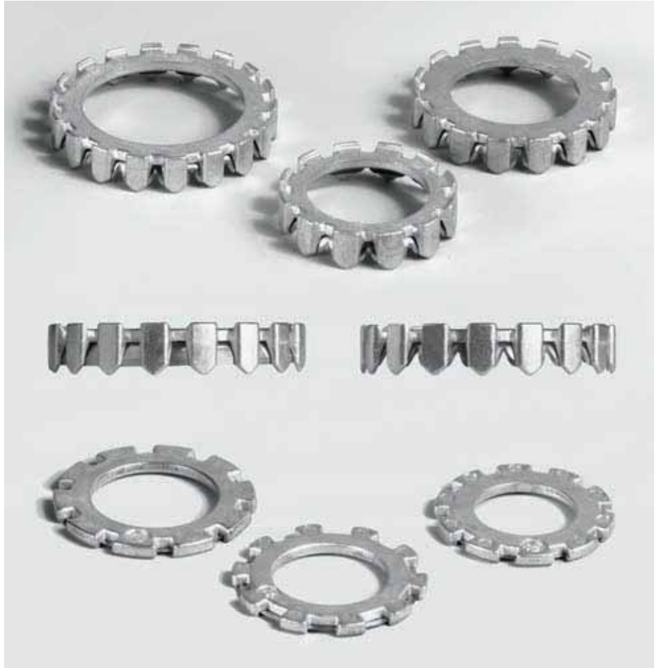
Choice of yarncutters

The need for aluminium plug top parts with yarncutters for use in automatic doffed frames is increasing from year to year. Therefore, Texparts is providing a big choice of yarncutters with and without disk knife blades.