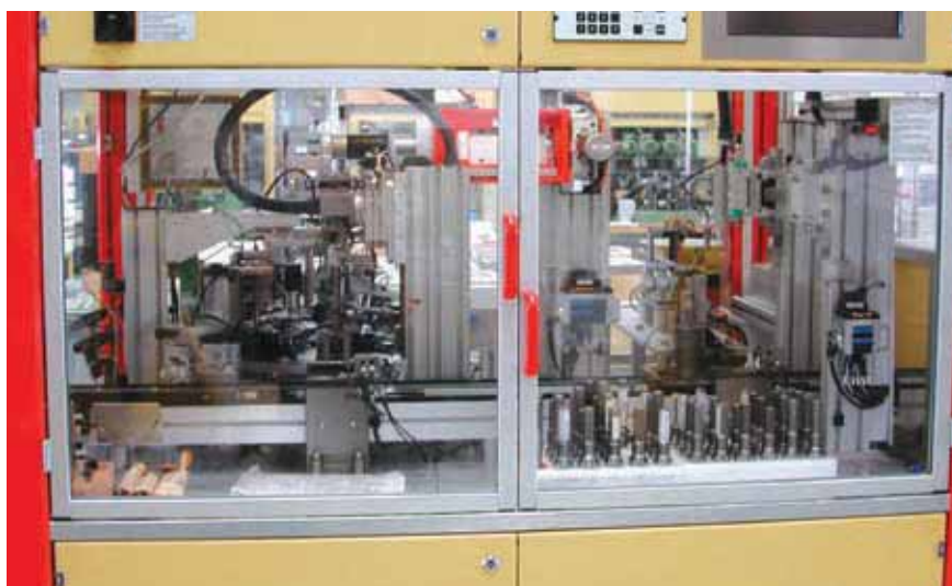
Test area within the assembly line for spindle bearings