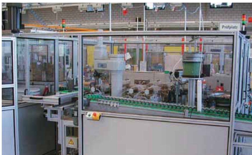
Fully automatic assembly line for spindle top parts