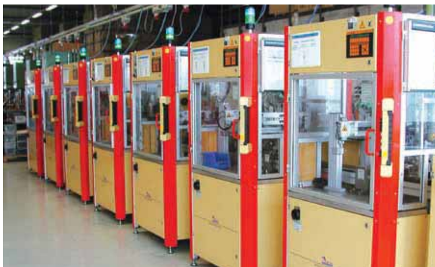
Fully automatic assembly line for spindle bearings in the Texparts production in Fellbach/Germany

We pay the same attention to the production of our top parts as we do to our spindle bearings. Up-to-date turning-, hardening- and grinding technologies for the manufacturing of all components and fully automatic assembling lines for the spindle bearings and the spindle top parts provide security for a consistent high quality level. No matter whether large quantities of standard spindles or small lots of tailor-made spindles have to be produced - one spindle is like the other.